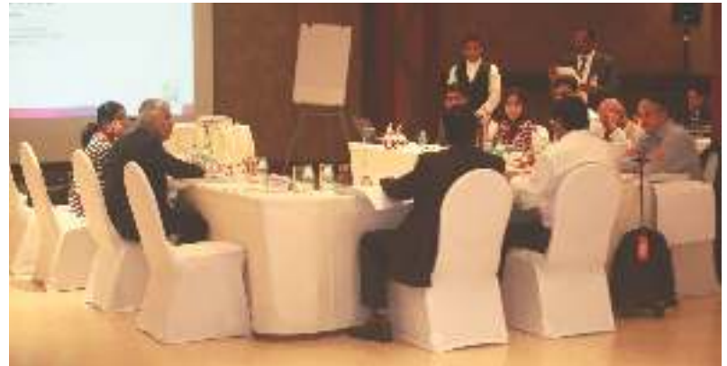
Discussions of Jury – Finalising the winners for Gateway Awards 2015