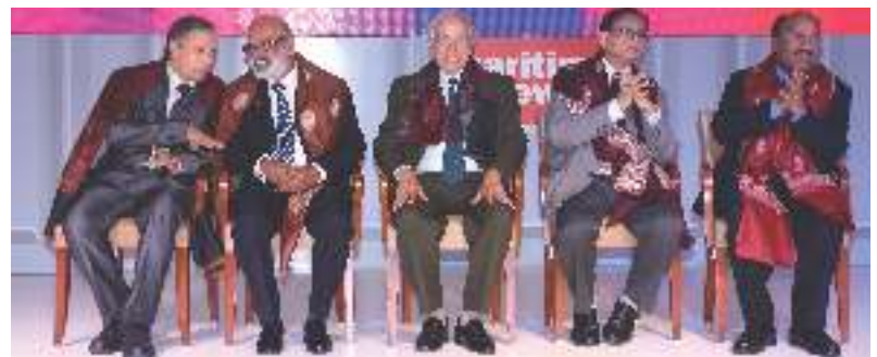
A Tribute to Change Agents – Former shipping secretaries who changed the course of Indian maritime industry were honoured at the awards night 2015.